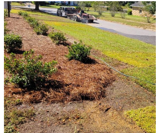
Royal Carriage Dr lower median New azaleas and sod